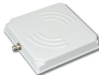
Read Range about 6m up to 12 m

arfidex GmbH | Adlerstraße 2 | D-63322 Rödermark | Germany | Phone: +49 (0) 6074 861930