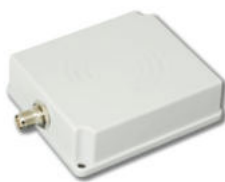
Read Range up to 3 m

E-5P Wide Beam Width (100°) E-6P Wide Beam Width (84°)